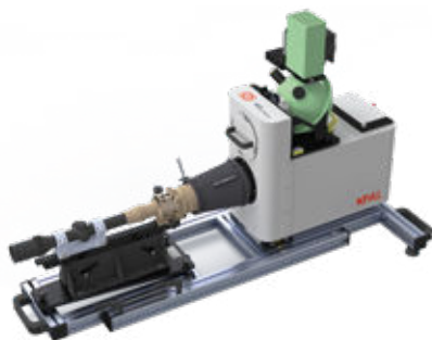
OPAL-NV testing night vision rifle scope